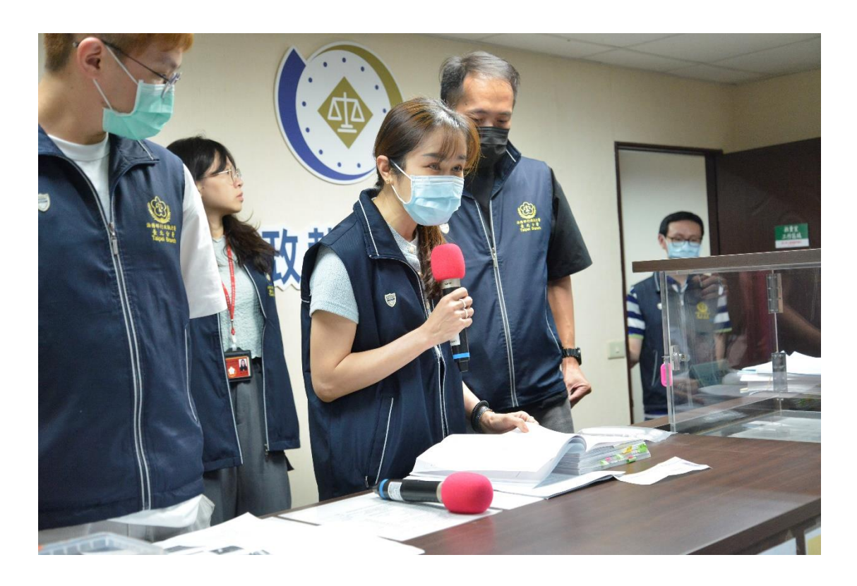
The Taipei Branch auctioned the building on Changchun Road, Zhongshan District, Taipei City for NT$14,401,000.