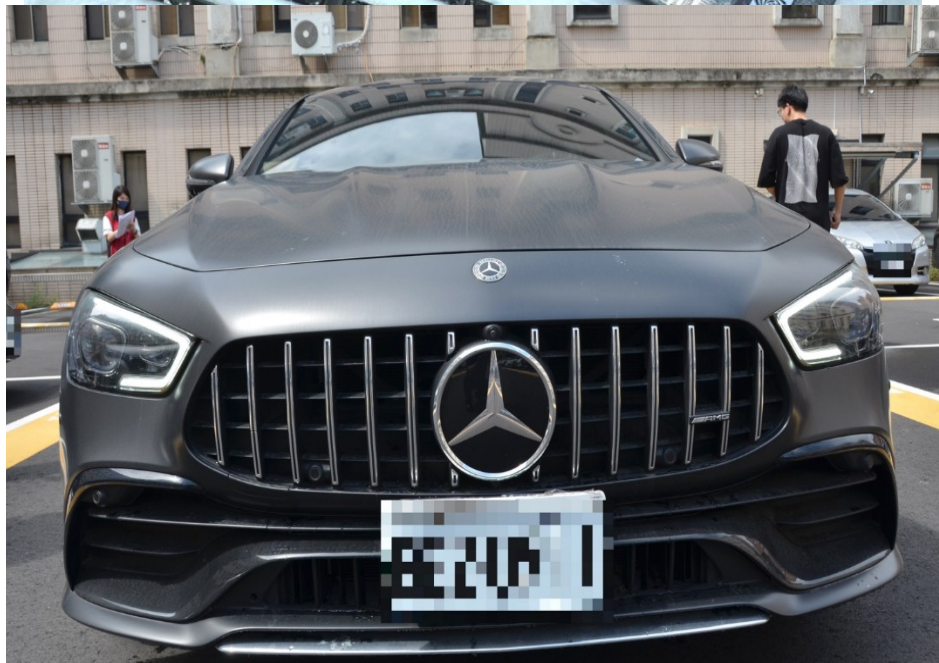
Taipei Branch auctioned germanium bracelets and many other