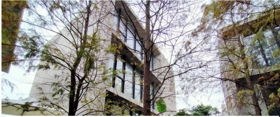
Yilan Branch auctioned a beautiful house located at Zhuangwei Township, Yilan County